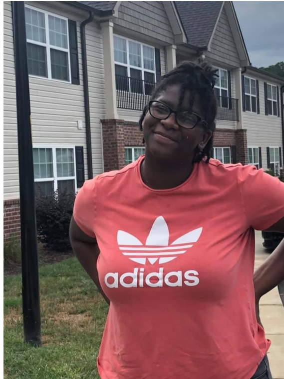
July 9 - Passed GED Test #1