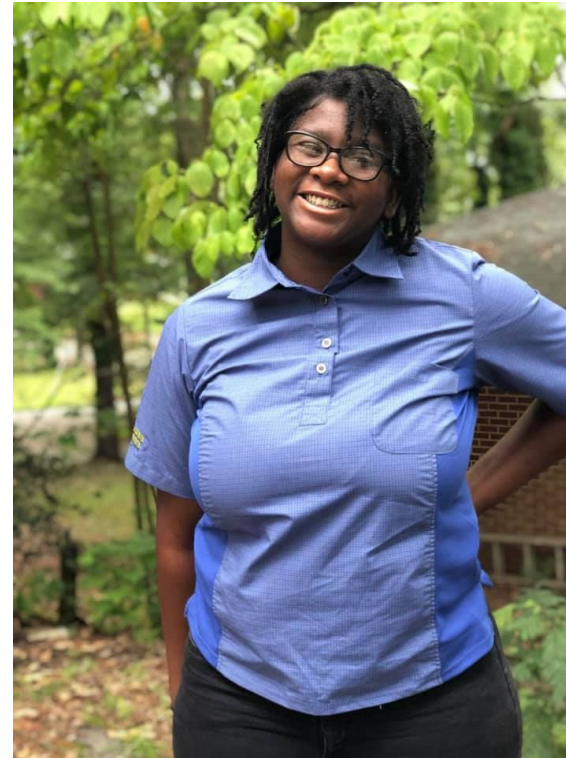
July 29 - Passed GED Test #4